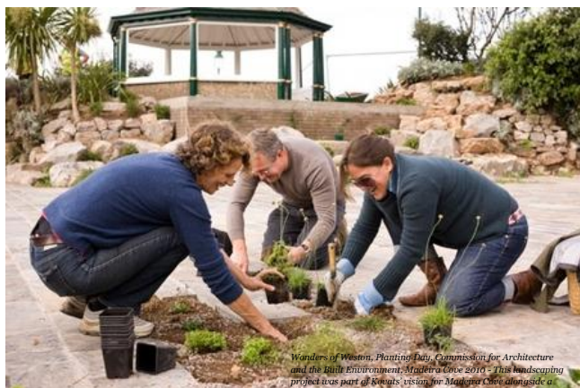
Members of Women, Planting Day, Commission for Architecture and the Built Environment, Madeira Cove 2014 - This landscaping project was part of 6 weeks' vision for Madeira Cove alongside a permanent installation.